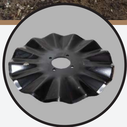
13 Wave VERTICAL TILL