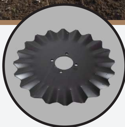
Samurai MINIMUM TILL