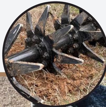
16" Heavy Duty Baskets