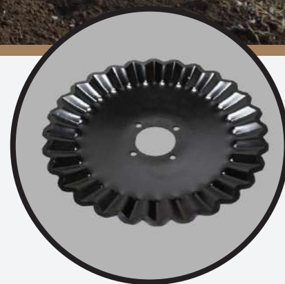
Concave HIGH SPEED TILL