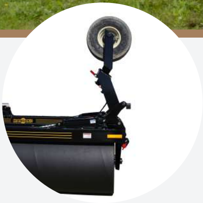
High Clearance HD Rear Axle