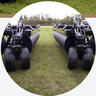
Patent Pending Fast Fold Axle