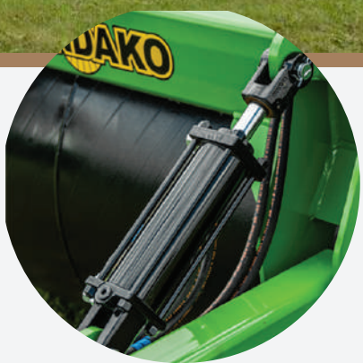
Hydraulic Floating Hitch